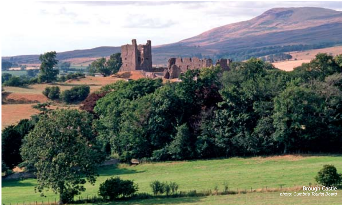
Brough Castle